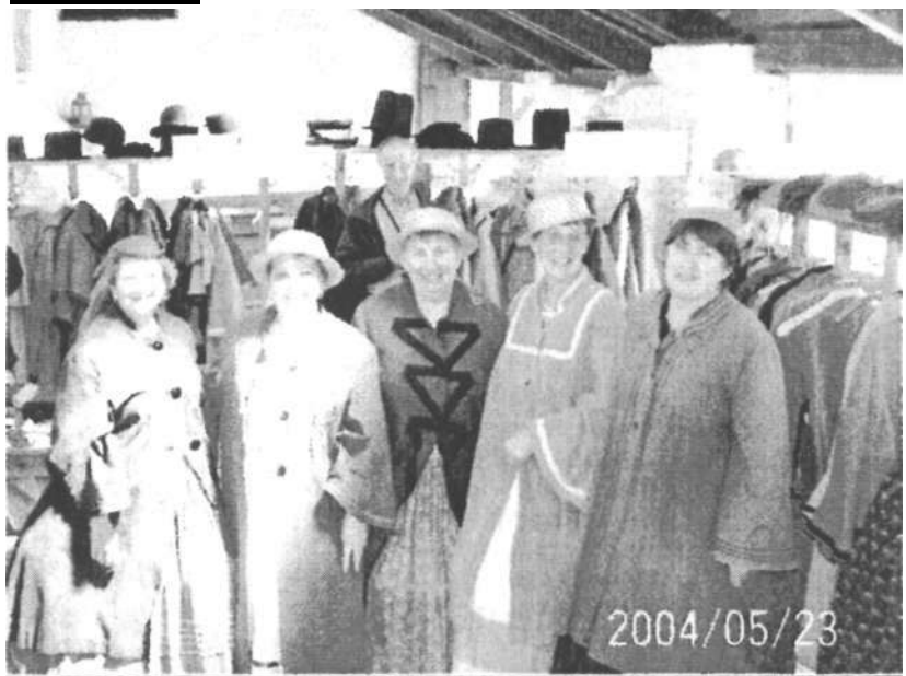
Lovely ladies at Morwelham all dressed up with no where to go.