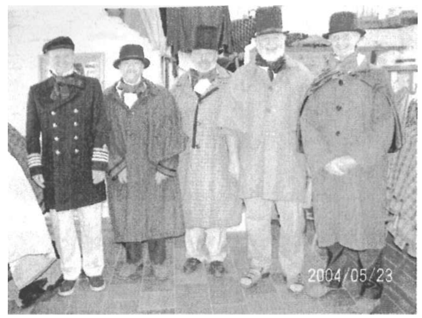
What a fine bunch of men!!. Dressing up in old clothes at Morwelham.