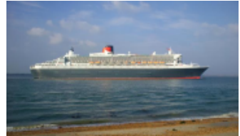
Queen Mary 2 lying off Southampton