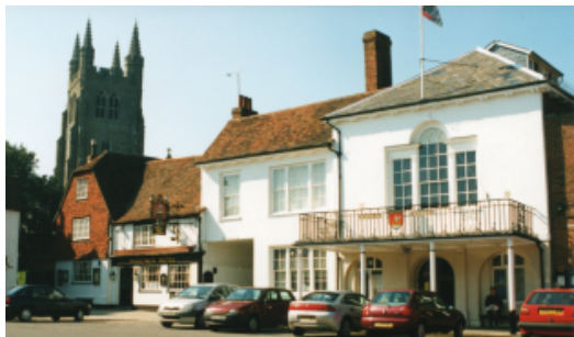
Tenterden High Street, with St Mildred’s church tower, the 15th-century Woolpack Inn, and the Town Hall.