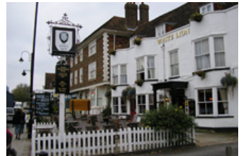
Top to bottom: Collina House Hotel; Little Silver Country Hotel; London Beach Country Hotel; White Lion Hotel