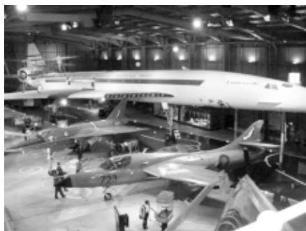
Exhibition Hall 4 at Yeovilton

Admission: adult £13.00, children 5–16 £9.00, concessions (with valid ID) £11.00, family (2 + 3) £38.00. Gp rate 15+: adult £10.00, children 5–16, £8.00, concessions £8.50. Disabled + carer £11.00+£6.50; child disabled, £5.00, serving military £6.00. Blue Peter badge holders free.