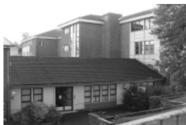
Below: Parkside Community College, Devonport.

On 1 April 2011 this decision was ratified. There will be a lengthy process, including the seeking of funds from outside bodies, before essential work can begin, and it may be several years before PWDRO moves to these premises. But at least decisions have at last been made.