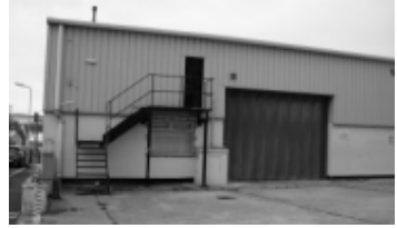
Above: Side entrance to the current PWDRO in Coxside.

Key historical documents of interest to many of our members are stored at the Plymouth & West Devon Record Office (PWDRO), currently housed in Coxside. This unsuitable building was opened in 1982, originally as a temporary measure.