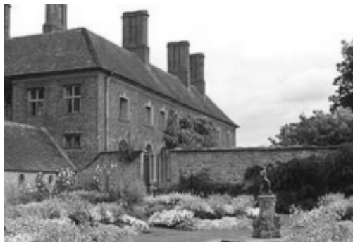
Barrington Court and part of the gardens.

Echoes of the past haunt this now empty Tudor manor house, so lovingly restored in the 1920s by Sir Arthur Lyle. Old farm buildings host a pottery and woodcarver, both of whom sell their wares. What were once cow yards, pens and fields have been transformed into fragrant and delightful flower gardens, their design influenced by Gertrude Jekyll. The stone-walled kitchen garden produces a variety of wonderful fruit and vegetables, which can be enjoyed in the restaurant, while the orchards provide the apples for our own cider and apple juice. This is a place to relax and refresh the senses.