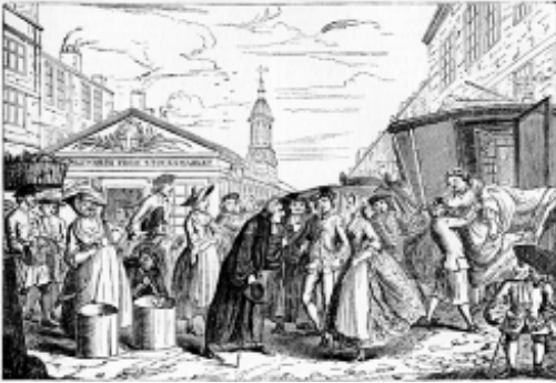
Above: Caricature of a Fleet marriage, conducted outside the London Prison .

Until Lord Hardwick's Marriage Act of 1753, there was another option. Irregular or clandestine marriages were conducted by clergy who had no parish. Poorly-paid clergy, with large families to support, often found themselves in debt. Some took other jobs, such as school-teaching, and earned extra from fees for conducting marriages in any church they could access for