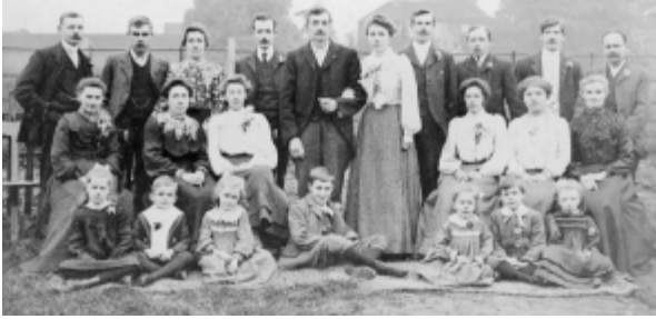
Left: For this early 20th-century wedding the bride wore a blouse and skirt. She, and the two younger women, have corsages, but there is no bouquet. The men have flowers in their buttonholes .

style was. My own grandmother, at her wedding in 1894, wore an outfit of brown and blue, with bridesmaids in a variety of colours.