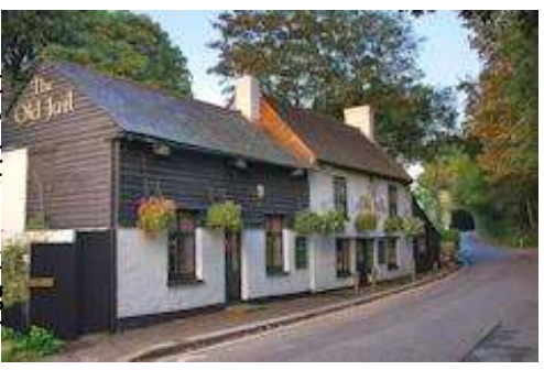
The Old Jail, Biggin Hill.

aside as a jail for prisoners awaiting transfer either to court, or to another parish — hence its name. More recently,