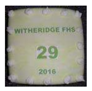
Celebrating 29 years of WFHS!

It was a small but friendly group that gathered at St Mark's Centre on the