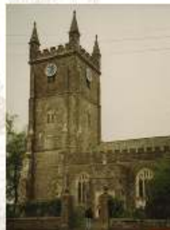
Church of St John the Baptist, Witheridge