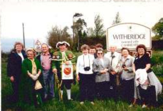
Some of the WFHS tour party, with the Witheridge Town Crier and his lady, at the Witheridge sign.