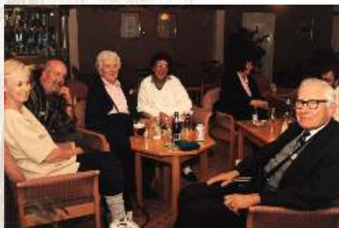
Reunion group, Tiverton, 1997: It was a great pleasure to welcome so many overseas members, most of whom were joining us for the first time.